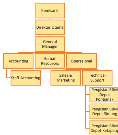
Figure 1.2. Organizational Structures of PT Wahanapatra

In collecting data, the researcher will use PT Wahanapatra as the object of the research. PT. Wahanapatra was established on November 29, 2005. It is a company that engaged in Industrial Fuel Transportation Services and Pertamina's Official Industrial Fuel Agent. As a company that engaged in transportation services for industrial fuel and an authorized agent for industrial fuel, PT. Wahanapatra employs 125 employees and is equipped with a fleet of 72 tank cars, 9 barges, and 6 ships that are ready to serve their customers.